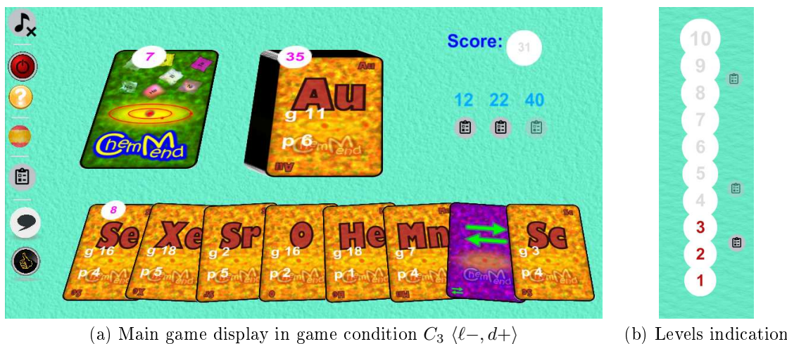
Figure 1: Screenshot of E-CHEMMEND’s main screen, with its three piles (a) and the difficulty levels (b). Here the draw pile has 7 cards, the discard pile has 35 cards, and the player pile has 8 cards. We refer to the difficulty levels according to the two experimental conditions \ell+ of our user study ( C_1 and C_2 ).

situations where the player does not have any chemical playable card, or just for strategic purposes. After using a wild card, the player must answer the corresponding card question that will be shown on the screen (Fig. 2) for a maximum of 5–10 seconds, depending on the game condition. The player has to guess correctly the group and period from one of the elements from cards from the discard pile, i.e. already played cards.