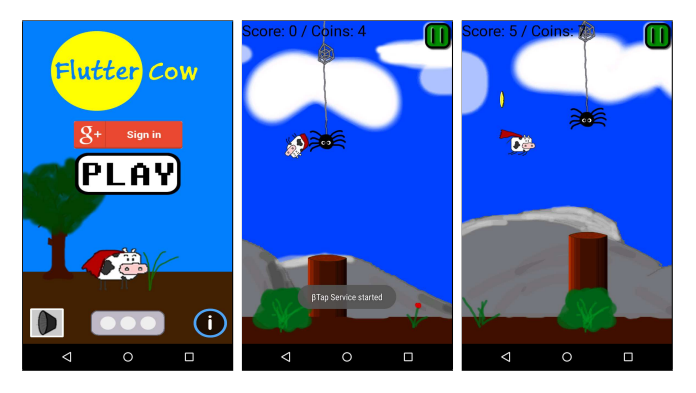
Figure 3: Screenshots of the BTap flutter cow game.

Available at https://play.google.com/store/apps/details?id= com.quchen.flappycow. This is a side-scrolling one-button game aking FlappyBird<sup>1</sup> or Badland.<sup>2</sup> The gameplay is fairly simple. The objective is to direct a flying cow, who moves continuously to the right, between sets of obstacles. The cow briefly flaps upward each time the player taps on the case of the device. If the case is not tapped, the cow falls because of gravity. If the player touches any obstacle, they lose. Here, BoD interaction allows for one-handed playing, freeing thus the other hand. Figure 3 depicts some screenshots of this game.