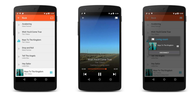
Figure 4: Screenshots of the βTap music player.

Google Cast devices. Here, \beta Tap is used to play/pause a song with a single tap, and advance to the next song with a double tap. It can also be used to play/stop casting to a nearby TV. These basic interactions allow e.g. for full screen visibility. Figure 4 shows some screenshots of this application.