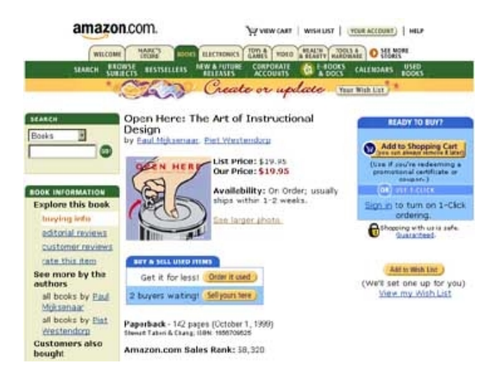
Figure 1: A teaser image.

Second Author AuthorCo, Inc. 123 Author Ave. author2@anotherco.com